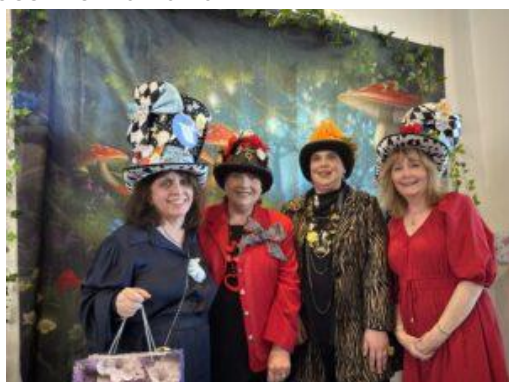
Our Mad Hat Winners

Thanks to the kindness and generosity of all our supporters, we are delighted to share that we raised $20,581.30 . These vital funds will enable us to continue providing comfort, care, and support to cancer patients and their families across the Illawarra.