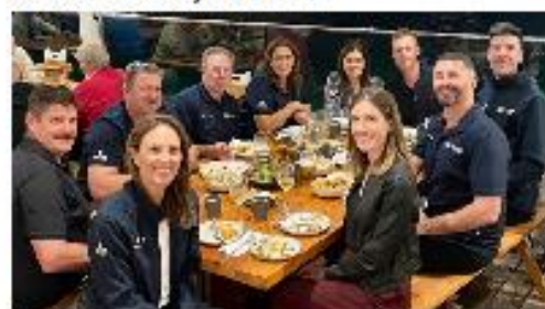
Pancare Par5 team